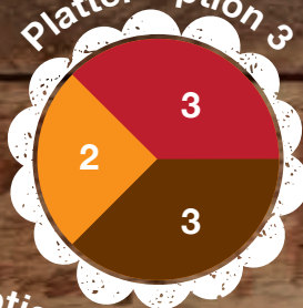
Platter Option 3