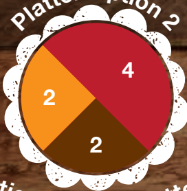
Platter Option 2