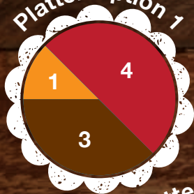
Platter Option 1