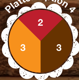
Platter Option 4